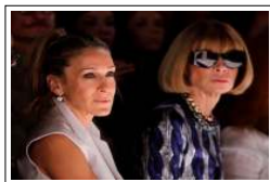
Front row stars at Fashion Week in New York