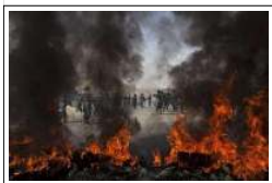
Afgghans stage anti-U.S. protest in Kabul