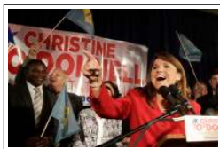
Big night for tea party: O'Donnell wins Delaware